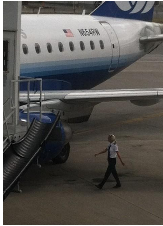
Shirt fits, pants fit, now about the tie??