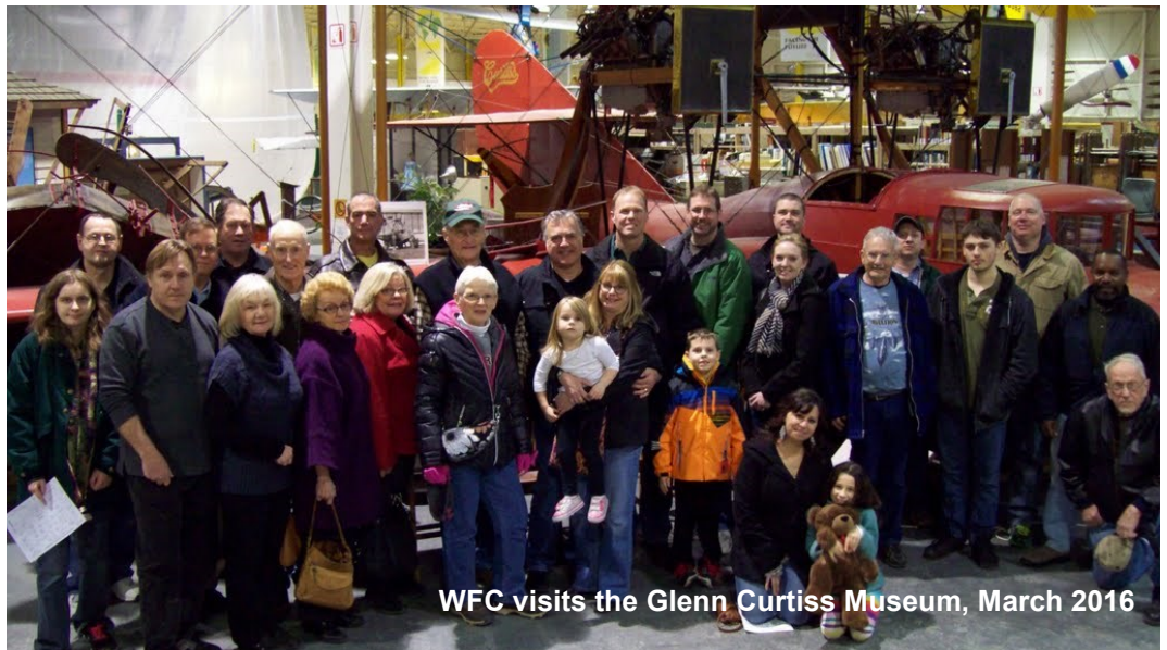
WFC visits the Glenn Curtiss Museum, March 2016

2016 was a challenging year for fly-out activities. Although we made a wildly successful flying trip to Cleveland's Burke Lakefront Airport in June, weather forced us to cancel many of our planned