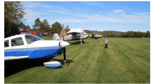
Looking toward the approach end of 20