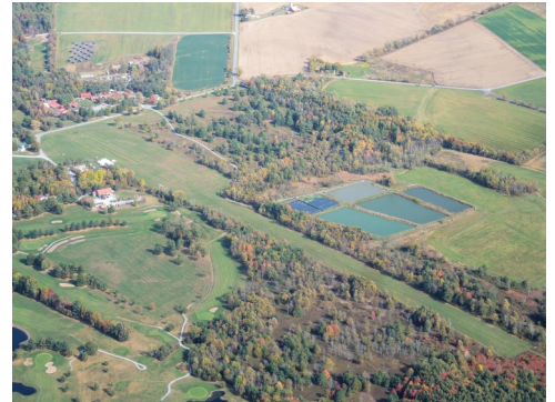
Runway 02-20 at Basin Harbor Airport