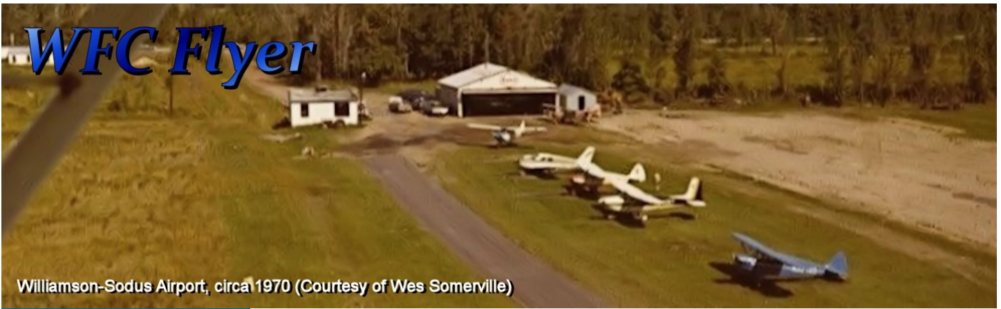
Williamson-Sodus Airport, circa 1970