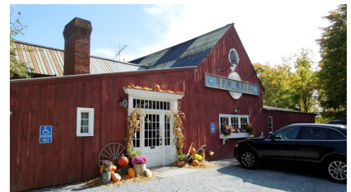
The Red Mill