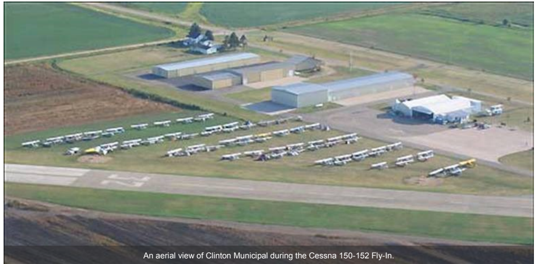
An aerial view of Clinton Municipal during the Cessna 150-152 Fly-In.