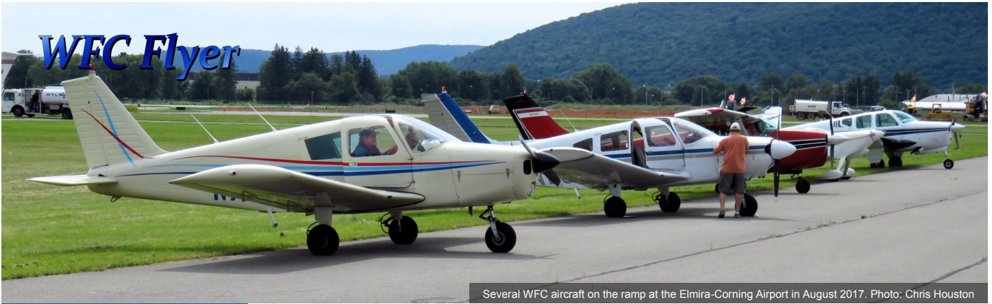
Several WFC aircraft on the ramp at the Elmira-Corning Airport in August 2017.