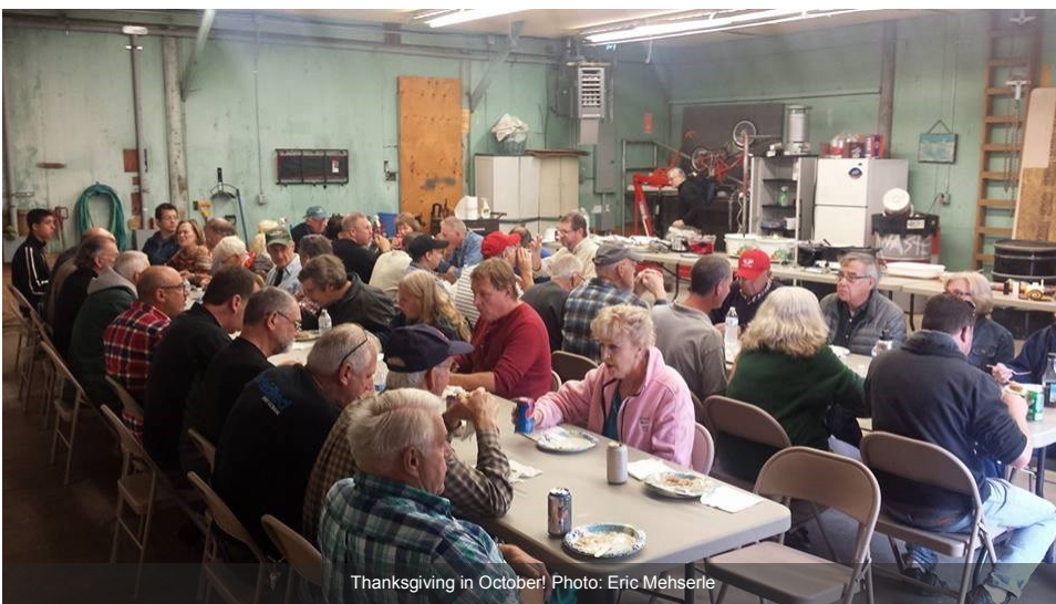
Thanksgiving in October!

On Saturday October 28, the WFC maintenance hangar was put to more delicious purpose than degreasing aircraft bellies when it served as home to our Thanksgiving in October lunch! !