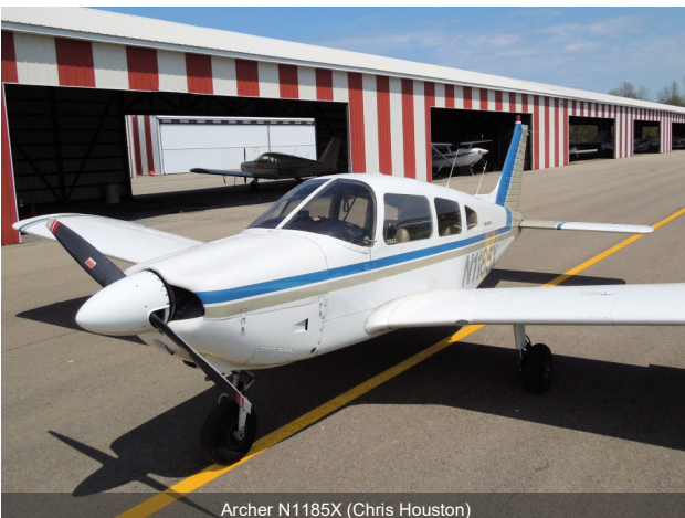
Archer N1185X (Chris Houston)

There are a lot of maintenance/upgrade projects planned for club aircraft over the next few months.