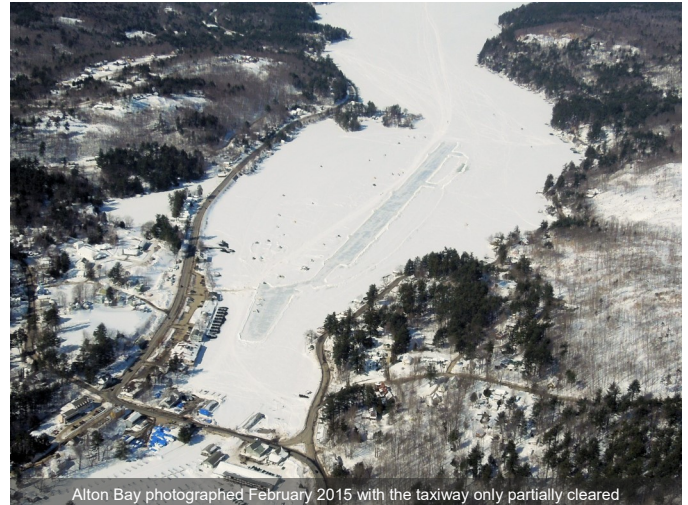
Alton Bay photographed February 2015 with the taxiway only partially cleared