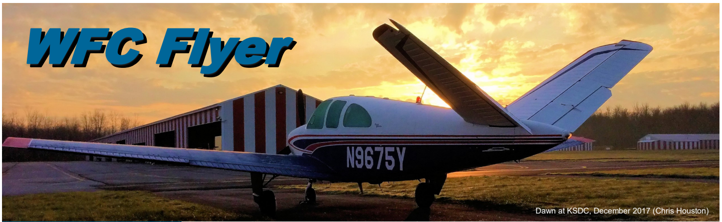
Dawn at KSDC, December 2017