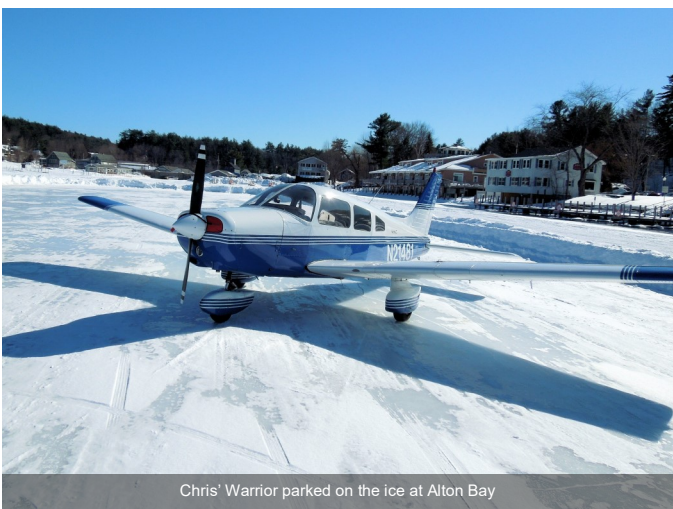
Chris' Warrior parked on the ice at Alton Bay