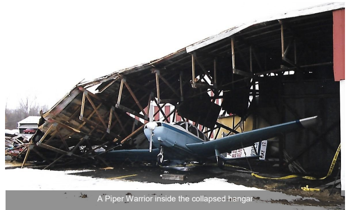
A Piper Warrior inside the collapsed hangar.

Back in the day, the club was mostly a member-supported organization. No reliever status, no AIP grant money or state funding, some income from fuel sales, and a few hangars. As a result, there was a considerable amount of creativity and elbow grease in how things got built and paid for around the club.