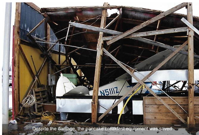
Despite the damage, the pancake breakfast equipment was saved.

Sometime in the 80's, with a lot of donated materials, club member donations and sweat equity as well as help from the Williamson BOCES industrial arts class and teacher, the club managed to build a 4-place open hangar, with a flat roof, so that they could keep the club airplanes out of the weather. Winters being what they are out in the “lake effect” Sodus NY area, the new hangar was a great help. However, along came January of 1999, when one night a large amount of snow fell