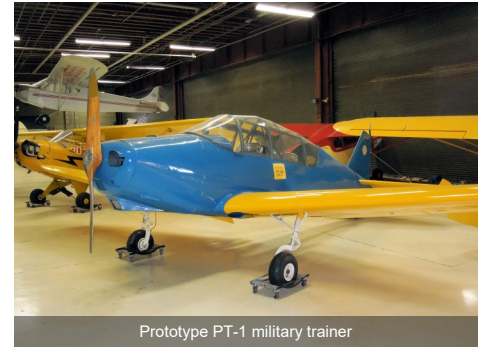
Prototype PT-1 military trainer