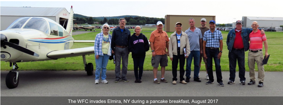
The WFC invades Elmira, NY during a pancake breakfast, August 2017

We encourage pilots to share the flying with other members, especially students and members limited by aircraft availability. Looking for a ride? Contact Chris Houston.