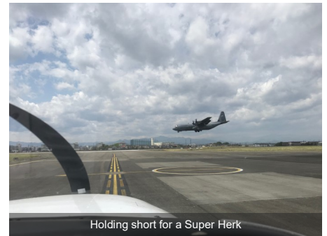
Holding short for a Super Herk