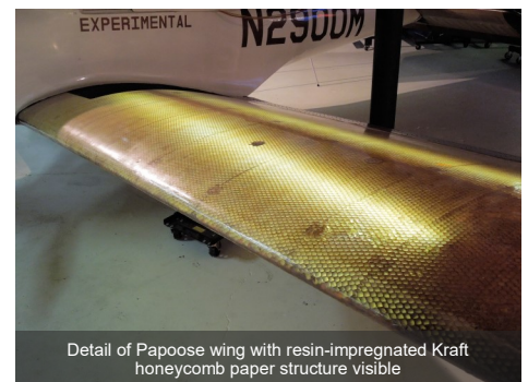
Detail of Papoose wing with resin-impregnated Kraft honeycomb paper structure visible