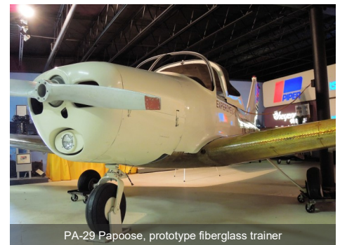
PA-29 Papoose, prototype fiberglass trainer