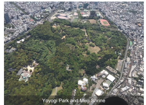
Yoyogi Park and Meiji Shrine