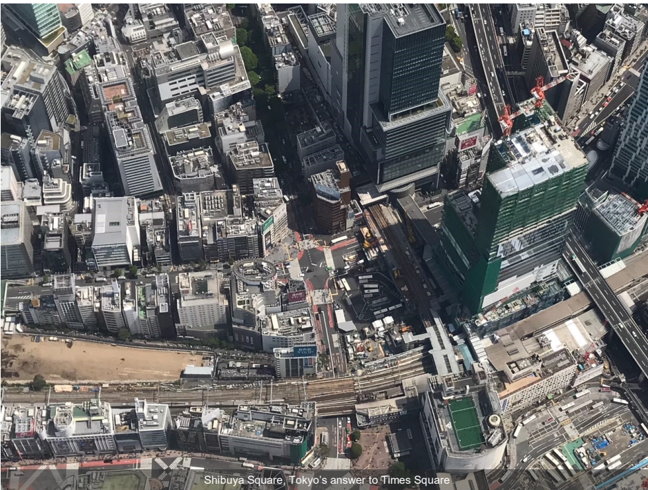
Shibuya Square, Tokyo's answer to Times Square