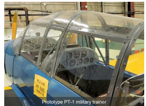
Prototype PT-1 military trainer