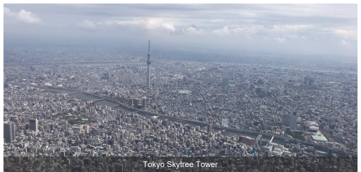
Tokyo Skytree Tower