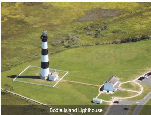
Bodie Island Lighthouse