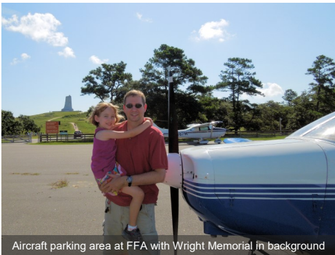
Aircraft parking area at FFA with Wright Memorial in background