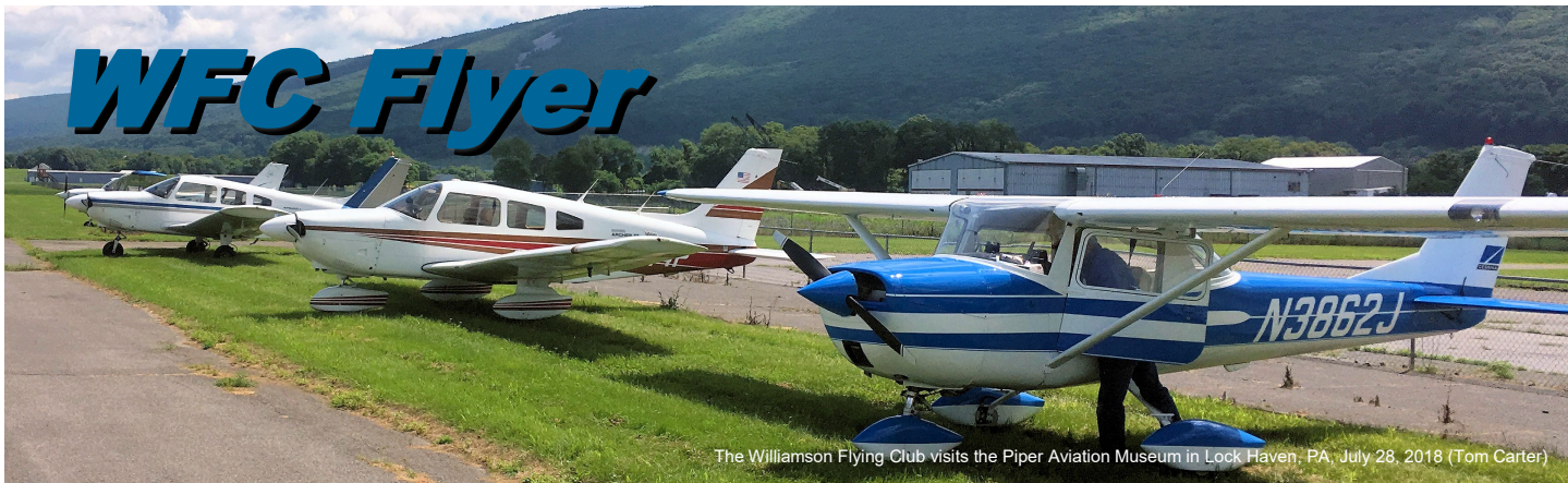
The Williamson Flying Club visits the Piper Aviation Museum in Lock Haven, PA, July 28, 2018