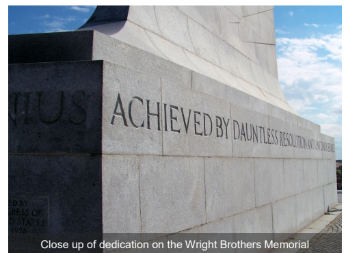
Close up of dedication on the Wright Brothers Memorial

"In commemoration of the conquest of the air by the brothers Wilbur and Orville Wright conceived by genius achieved by dauntless resolution and unconquerable faith."