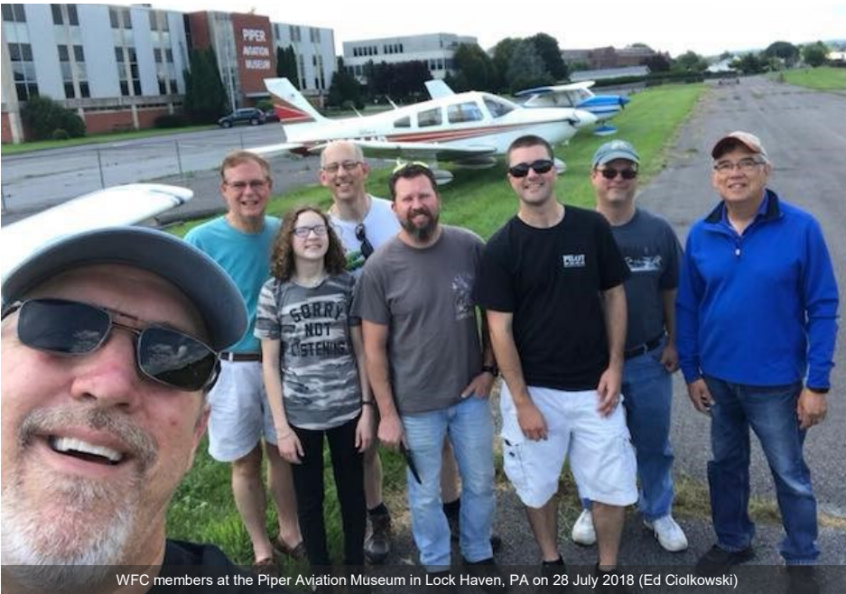
WFC members at the Piper Aviation Museum in Lock Haven, PA on 28 July 2018