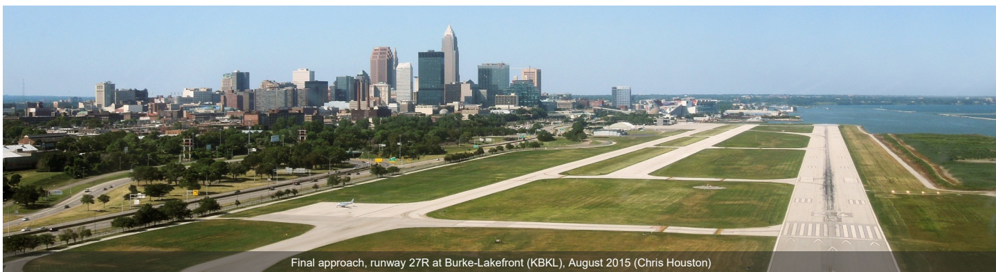
Final approach, runway 27R at Burke-Lakefront (KBKL), August 2015

Items in bold are sponsored by the WFC Activities Committee