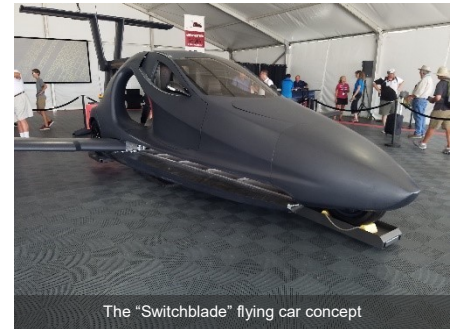
The "Switchblade" flying car concept

AirVenture is a great show, with interesting