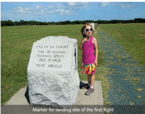
Marker for landing site of the first flight