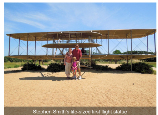
Stephen Smith's life-sized first flight statue