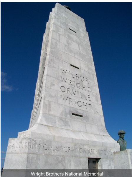
Wright Brothers National Memorial