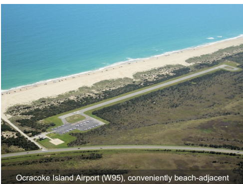
Ocracoke Island Airport (W95), conveniently beach-adjacent