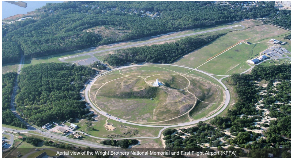
Aerial view of the Wright Brothers National Memorial and First Flight Airport (KFFA)

I have flown to First Flight twice, in 2011 and 2013. As a pilot, both pilgrimages held a lot of meaning for me. On the first, I crossed the 1000 hour mark in my logbook. On the second, I had the pleasure of sharing the site with my family. Along these lines, First Flight is also a great family destination. Like many of the National Parks, this one has a Junior Ranger program (rebranded as a "Junior Flight Ranger" program for extra cool factor). Junior