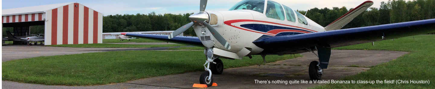
There's nothing quite like a V-tailed Bonanza to class-up the field!