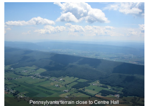
Pennsylvania terrain close to Centre Hall