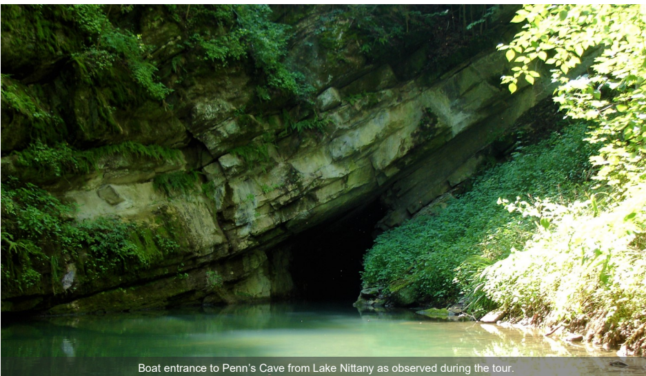
Boat entrance to Penn's Cave from Lake Nittany as observed during the tour.

The Seneca Indians were aware of the cave. Local legend holds that French trapper Malachi Boyer fell in love with a Seneca Maiden, Nita-Nee. Her brothers did not approve and trapped the Frenchman in Penn's Cave. When Boyer