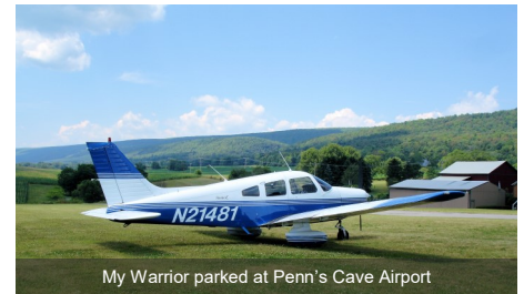
My Warrior parked at Penn's Cave Airport