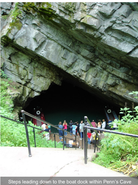
Steps leading down to the boat dock within Penn's Cave

Cavern tours are $18.99 for adults, children 2- 12 years old are $10.99, and seniors (65+) are $17.99. The location also has other attractions including a Farm Nature Wildlife Tour and a maze for kids. Package pricing is available on the organization's website ( https://pennscave.com ).