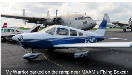
My Warrior parked on the ramp near MAAM's Flying Boxcar