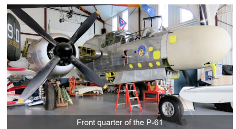
Front quarter of the P-61