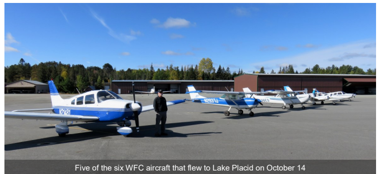
Five of the six WFC aircraft that flew to Lake Placid on October 14