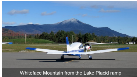
Whiteface Mountain from the Lake Placid ramp