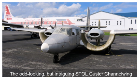
The odd-looking, but intriguing STOL Custer Channelwing