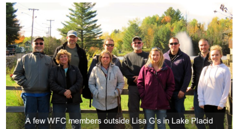
A few WFC members outside Lisa G's in Lake Placid