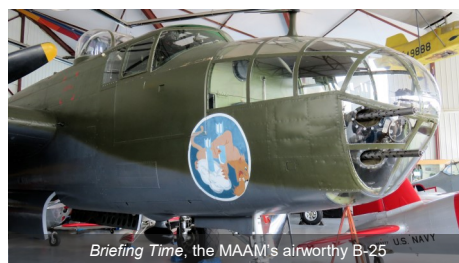
Briefing Time, the MAAM's airworthy B-25