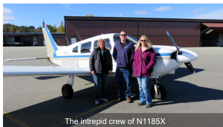
The intrepid crew of N1185X