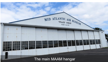
The main MAAM hangar

Additional photographs from MAAM can be found on my blog .