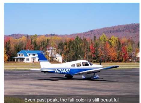
Even past peak, the fall color is still beautiful