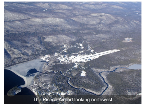
The Piseco Airport looking northwest