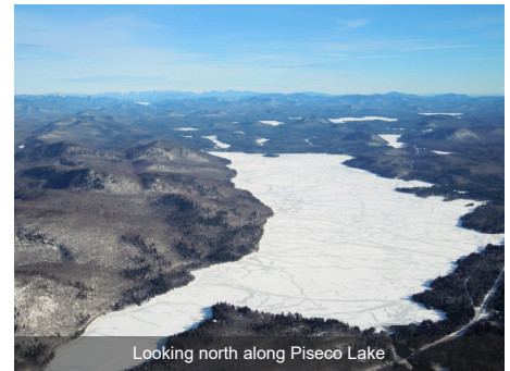
Looking north along Piseco Lake