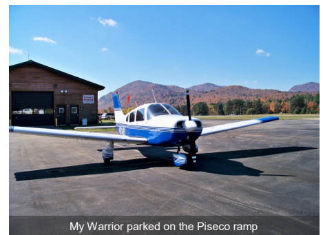
My Warrior parked on the Piseco ramp