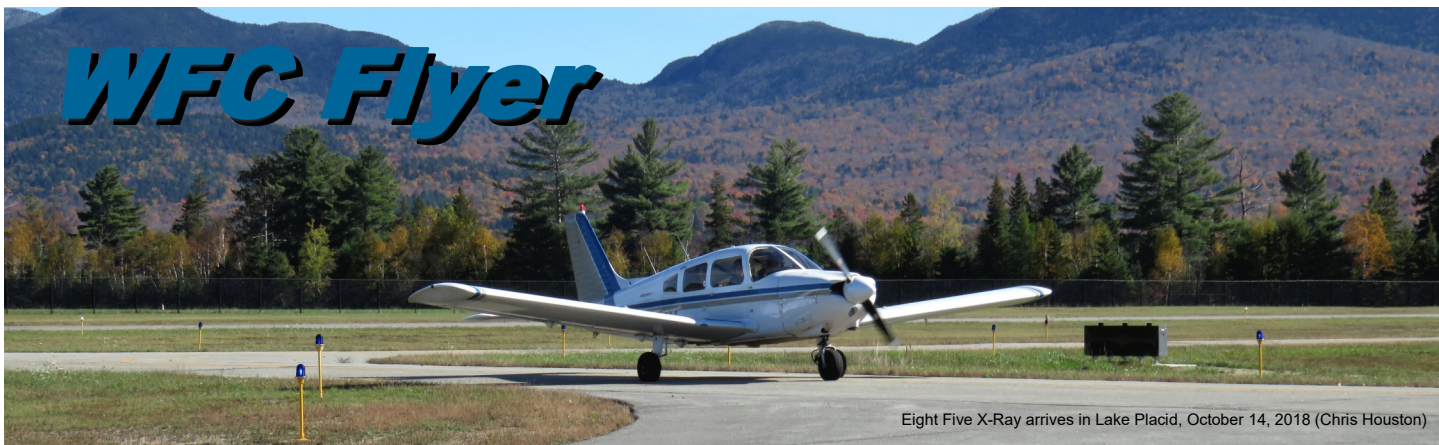
Eight Five X-Ray arrives in Lake Placid, October 14, 2018 (Chris Houston)