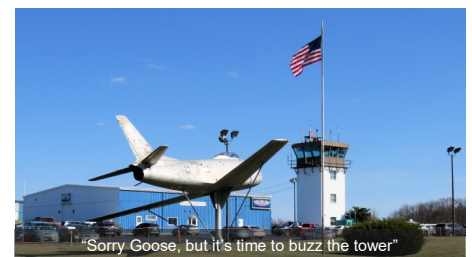
"Sorry Goose, but it's time to buzz the tower"