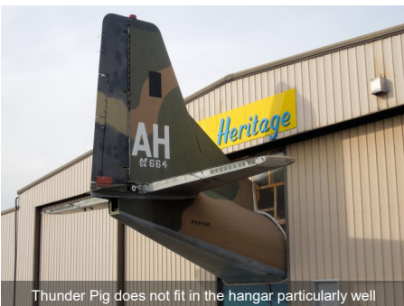
Thunder Pig does not fit in the hangar particularly well

One is the Air Heritage Museum , which is modest aviation museum actively working to restore multiple aircraft. Perhaps its best known aircraft is the world's only remaining airworthy Fairchild C-123 Provider cargo aircraft, the aptly named "Thunder Pig". The airplane is large enough that the museum