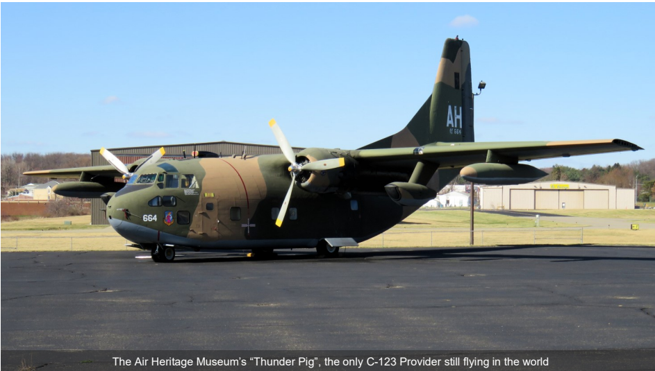
The Air Heritage Museum's "Thunder Pig", the only C-123 Provider still flying in the world