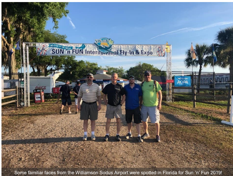
Some familiar faces from the Williamson Sodus Airport were spotted in Florida for Sun 'n' Fun 2019!

Clearly, our President is a man of many talents!