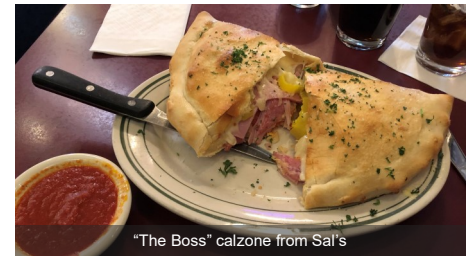
"The Boss" calzone from Sal's

ation. AirQuest has a fuel truck and will come to you wherever you park.