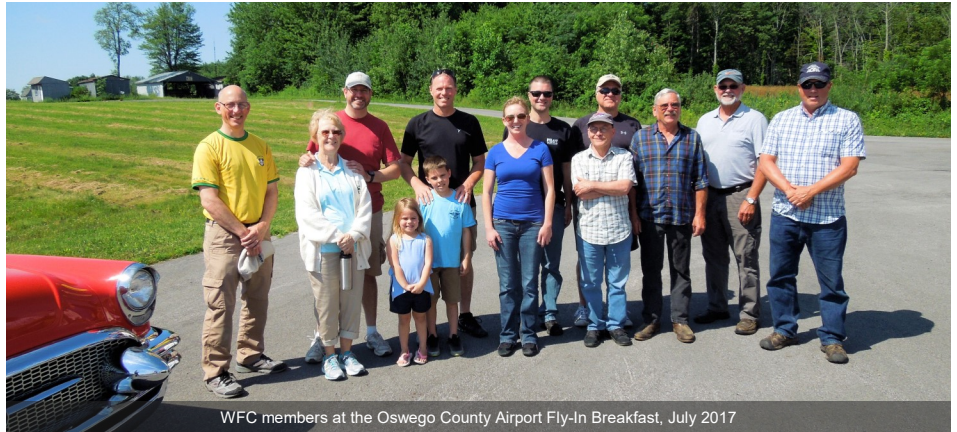
WFC members at the Oswego County Airport Fly-In Breakfast, July 2017

simply RSVP through the calendar. Bringing guests? You can add the appropriate number. If you're not comfortable with the Event Calendar system, contact the event organizer.