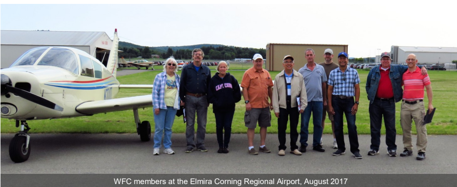
WFC members at the Elmira Corning Regional Airport, August 2017