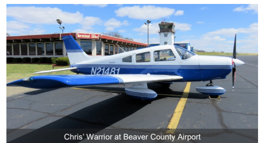
Chris' Warrior at Beaver County Airport

Beaver County Airport is a towered field located north of Pittsburgh on the outer edge of Class Bravo airspace. It