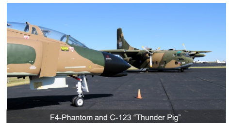
F4-Phantom and C-123 "Thunder Pig"