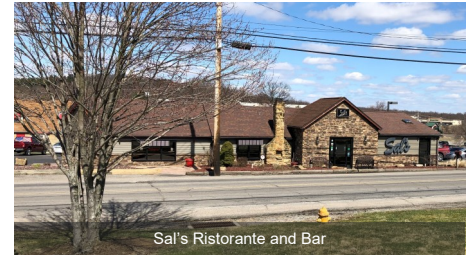
Sal's Ristorante and Bar