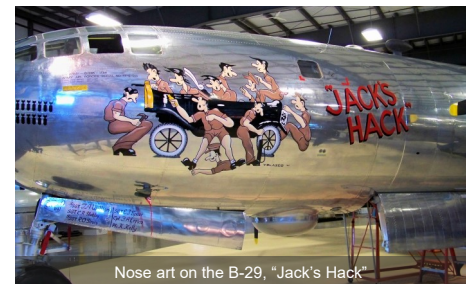
Nose art on the B-29, "Jack's Hack"