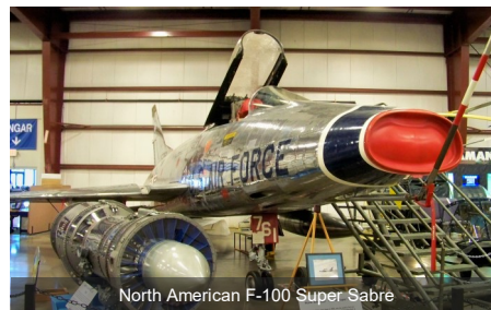
North American F-100 Super Sabre