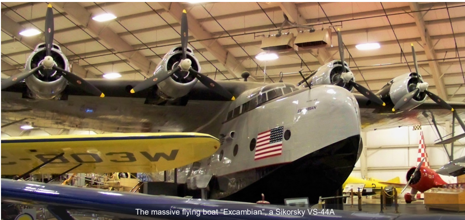
The massive flying boat "Excambian", a Sikorsky VS-44A