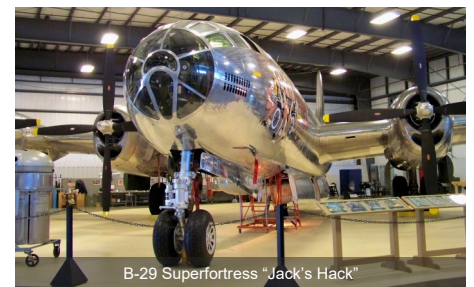
B-29 Superfortress "Jack's Hack"