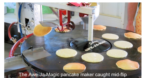
The Awe-Ja-Magic pancake maker caught mid-flip