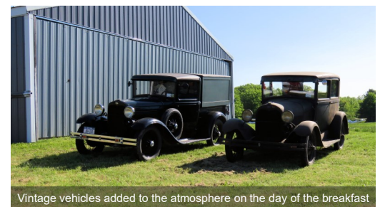
Vintage vehicles added to the atmosphere on the day of the breakfast