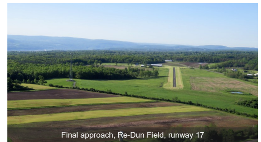
Final approach, Re-Dun Field, runway 17