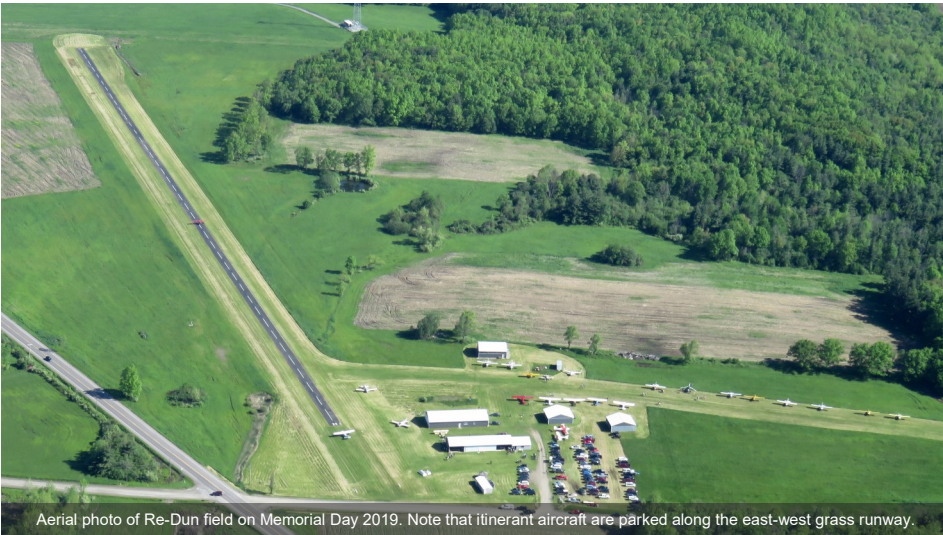
Aerial photo of Re-Dun field on Memorial Day 2019. Note that itinerant aircraft are parked along the east-west grass runway.