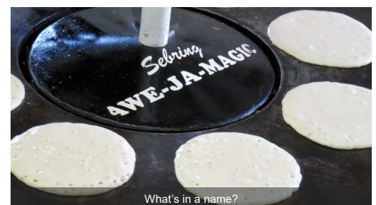
What’s in a name?