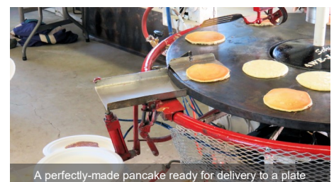
A perfectly-made pancake ready for delivery to a plate