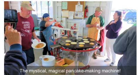
The mystical, magical pancake-making machine!