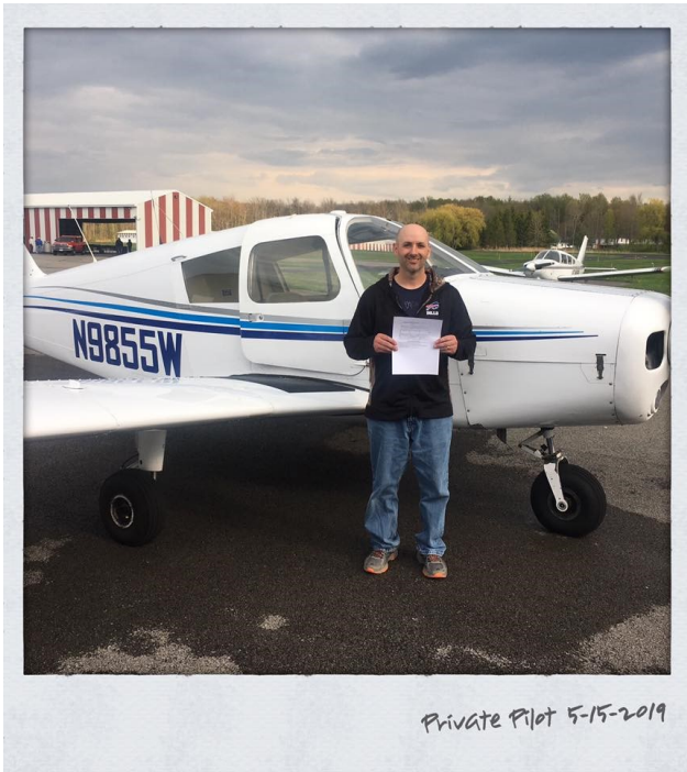
Private Pilot 5-15-2019