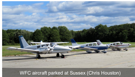
WFC aircraft parked at Sussex (Chris Houston)

As an interesting historical footnote, Sussex was the home airport of famed aerobatic pilot Leo Loudenslager and a monument to him stands on the edge of the ramp. It depicts the Laser 200 aerobatic monoplane that Leo made famous in the 1970s. Loudenslager is generally credited with popularizing aerobatic monoplanes of the type that so dominate high energy aero-