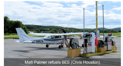
Matt Palmer refuels 6ES

were able to figure it out. Fuel is currently $4.95/gal.