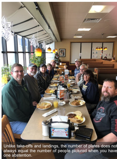
Unlike take-offs and landings, the number of plates does not always equal the number of people pictured when you have one abstention.