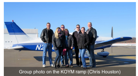
Group photo on the KOYM ramp (Chris Houston)