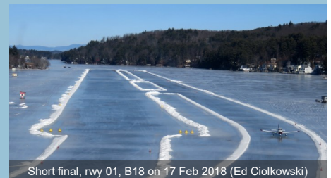
Short final, rwy 01, B18 on 17 Feb 2018