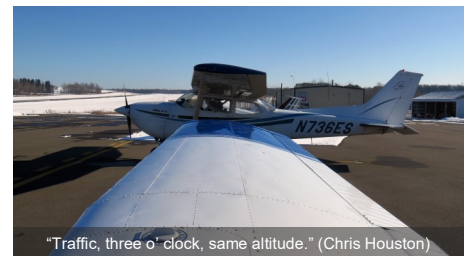
"Traffic, three o'clock, same altitude." (Chris Houston)

When winter sets in, but still allows a journey out of the local area, those opportunities need to be seized! Seven people took advantage of the stellar day to visit St Marys (KOYM) for breakfast.