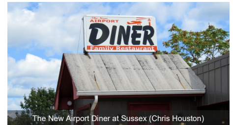
The New Airport Diner at Sussex (Chris Houston)