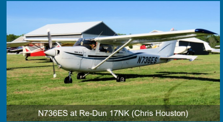
N736ES at Re-Dun 17NK

This new pricing will be in effect on January 1, 2020.