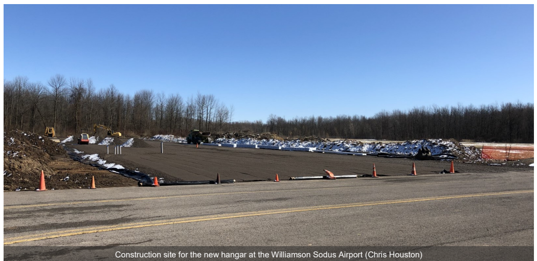
Construction site for the new hangar at the Williamson Sodus Airport

Pictures speak louder than words. As we head into spring, the site for our new hangar appears to be well-prepared. This photo was taken on March 7 looking east(ish) toward the approach end of runway 28.