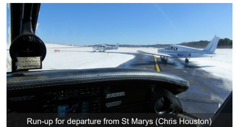
Run-up for departure from St Marys