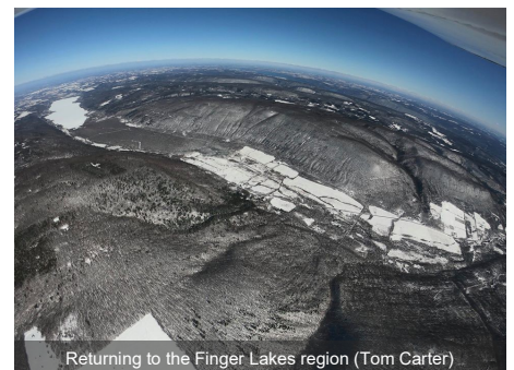
Returning to the Finger Lakes region (Tom Carter)

We held our first official Activities Committee fly-out to St Marys on 01 March 2020. Nine members flew six aircraft to breakfast at The West Wind, enjoying smooth air and a clear blue sky. The best quote of the day came from Cleveland Center: "OK, I just gotta ask. What's going on in St Marys this morning?"