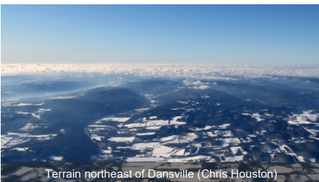
Terrain northeast of Dansville