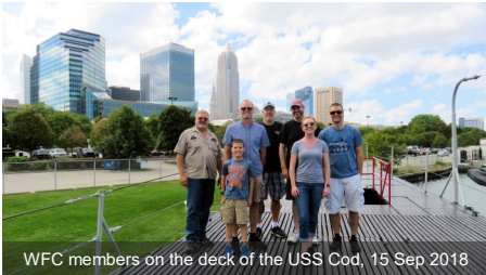
WFC members on the deck of the USS Cod, 15 Sep 2018

Steamship William G Mather , a 1925 Great Lakes freighter that can be explored from stem to stern. After four trips to BKL over the years, the Mather remains an elusive destination for me owing to (1) a freak fire the day before my second visit and (2) a heat advisory in effect during my third visit. (Foreshadowing: look for an Activities Committee trip to Cleveland this summer.) The Mather will be available for tours starting in May.