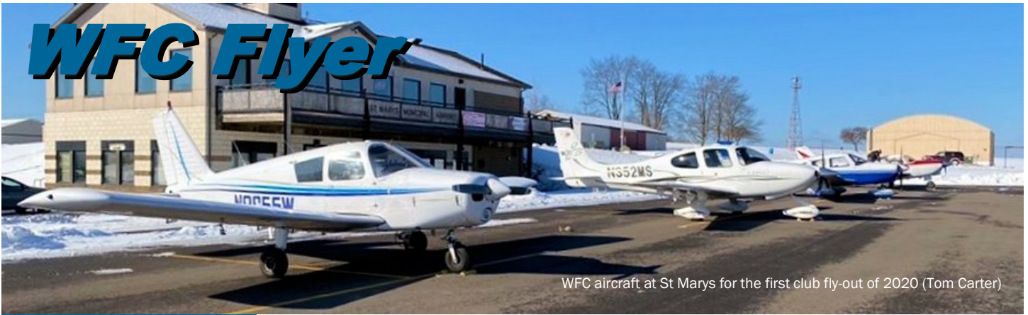
WFC aircraft at St Marys for the first club fly-out of 2020