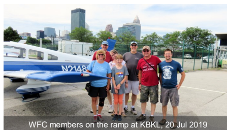
WFC members on the ramp at KBKL, 20 Jul 2019

take a moment to peruse the International Women's Air & Space Museum, housed in the BKL terminal. This free museum immortalizes the contributions of many woman aviators, from the well-known likes of Amelia Earhart, to lesser known pilots like Jerrie Mock, an Ohio housewife who became the first woman to fly solo around the world in her Cessna 180. Cool stuff!