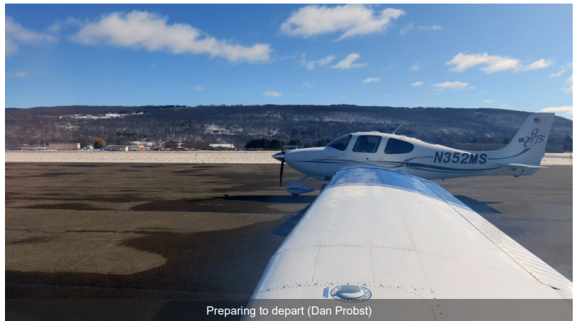
Preparing to depart (Dan Probst)