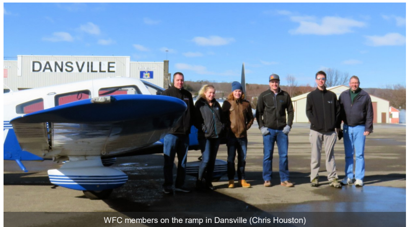
WFC members on the ramp in Dansville