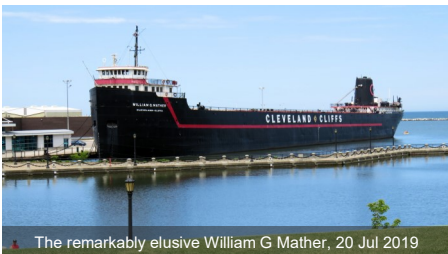
The remarkably elusive William G Mather, 20 Jul 2019

Steamship William G Mather , a 1925 Great Lakes freighter that can be explored from stem to stern. After four trips to BKL over the years, the Mather remains an elusive destination for me owing to (1) a freak fire the day before my second visit and (2) a heat advisory in effect during my third visit. (Foreshadowing: look for an Activities Committee trip to Cleveland this summer.) The Mather will be available for tours starting in May.