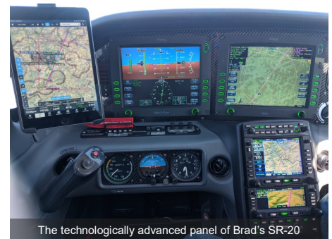
The technologically advanced panel of Brad's SR-20