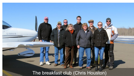
The breakfast club (Chris Houston)