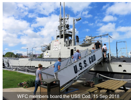
WFC members board the USS Cod, 15 Sep 2018

Or, you can choose to explore the USS Cod , a World War II era submarine originally launched in 1943 (adult admission, $10). The Cod can be toured in 2020 starting Saturday, April 25.