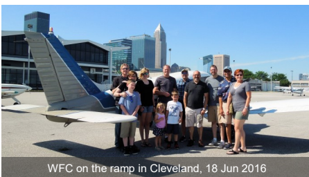
WFC on the ramp in Cleveland, 18 Jun 2016

There are several reasons why Burke Lakefront is a worthwhile destination, starting with the airport itself. BKL is situated on the Cleveland waterfront directly adjacent to Lake Erie. The approach is stunning, performed between city skyline and lake. Landing here provides immediate, pedestrian access to Cleveland's center city. Burke Lakefront is probably the closest thing we have left to Chicago's dear, departed Meigs Field.