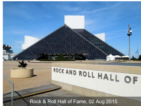
Rock & Roll Hall of Fame, 02 Aug 2015

ited on my first visit to BKL in 2015 and thoroughly enjoyed it.