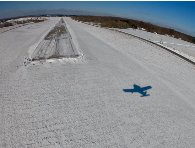
A camera mounted under the wing of 55W yields some interesting perspectives, like this shadow selfie captured while on short final to runway 28 at St Marys Municipal Airport (KOYM).