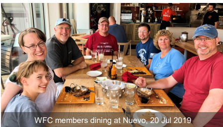
WFC members dining at Nuevo, 20 Jul 2019

Nuevo Modern Mexican and Tequila Bar , true to its name, is a neo-Mexican restaurant on the waterfront behind the Rock & Roll Hall of Fame. I've had two very enjoyable visits there, but given my pilot-