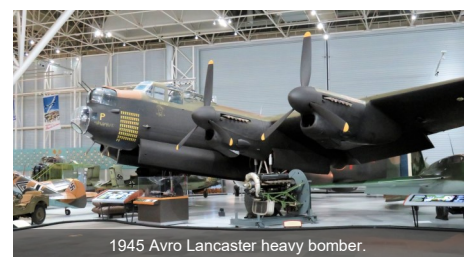
1945 Avro Lancaster heavy bomber.