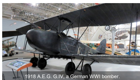
1918 A.E.G. G.IV, a German WWI bomber.