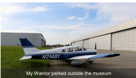
My Warrior parked outside the museum