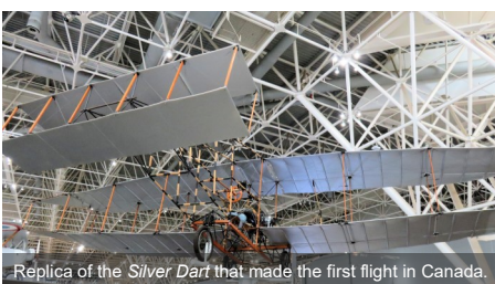
Replica of the Silver Dart that made the first flight in Canada.