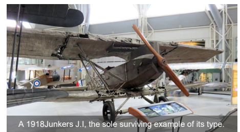
A 1918Junkers J.I, the sole surviving example of its type.