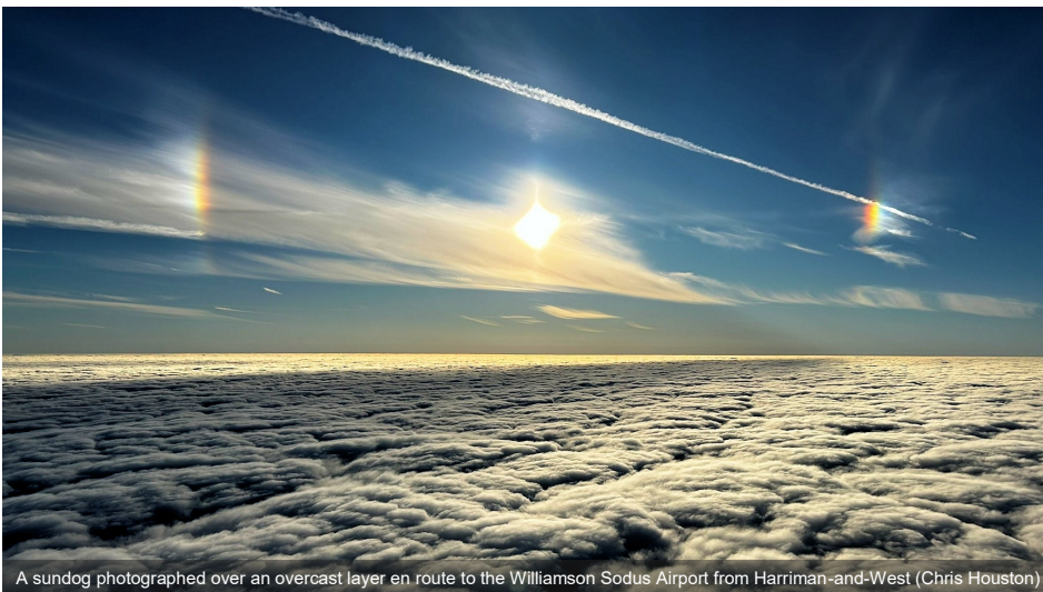
A sundog photographed over an overcast layer en route to the Williamson Sodus Airport from Harriman-and-West

On behalf of the Williamson Flying Club Board of Directors, we wish all of our members happy holidays and extend our hopes for a wonderful new year! Adventure awaits! May your hours be high and the wind always at your back!