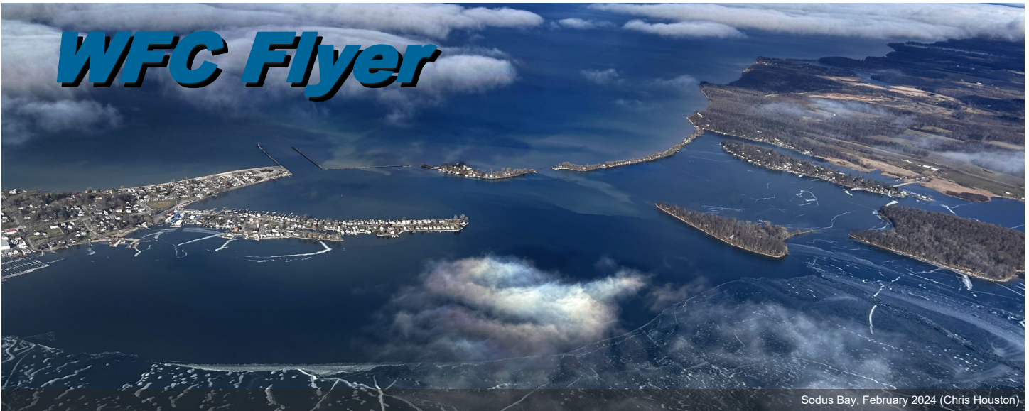
Sodus Bay, February 2024 (Chris Houston)